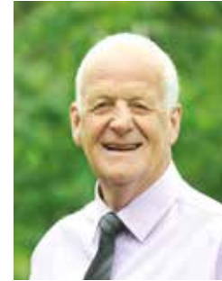
The Chairman of the Trust Board of the ORTU Trust

On behalf of the Hassenbrook Governing Body and the Trust Board we would like to welcome all our new pupils and parents to Hassenbrook Academy.