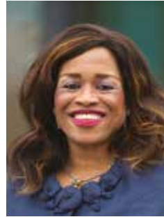
The Chief Executive Officer of the Trust Board of the ORTU Trust